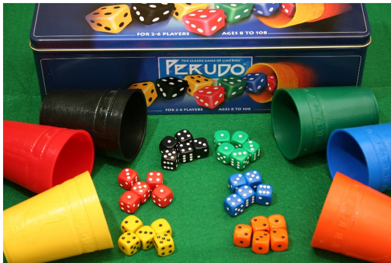
Perudo, a commercial production of the folk game Dudo